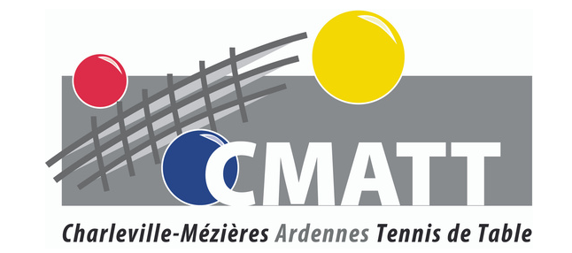
Table tennis hall Reine Bestel 14 chemin du Mémorial Charleville-Mézières France

Saturday 3 et Sunday 4 September 2022 CHARLEVILLE-MÉZIÈRES INTERNATIONAL YOUTH OPEN individual events tables categories 2007 to 2014 and more 3 team challenges