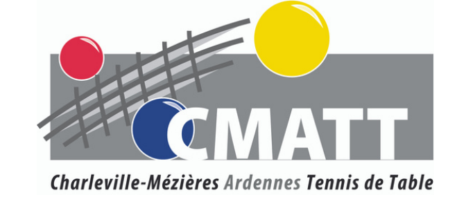
Table tennis hall Reine Bestel 14 chemin du Mémorial Charleville-Mézières France