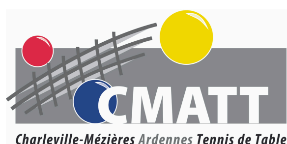
Table tennis hall Reine Bestel 14 chemin du Mémorial Charleville-Mézières France